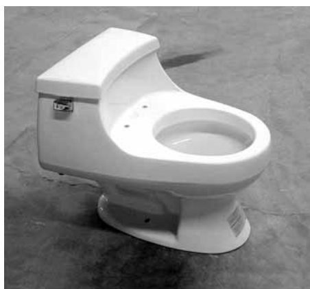
Figure 2 One-piece toilet

Prior to 1980 many toilets flushed with 20 litres of water. Then the 13-litre or “water saver” toilets became available in the early 1990s. They are still available in the marketplace. In 1996, the Ontario Building Code introduced legislation requiring 6-litre toilets for all new homes. Currently, no other province or territory has this legislation but some municipalities, such as Vancouver, have their own 6-litre bylaws. Six-litre toilets are often referred to as ultra-low-flush (ULF) toilets.