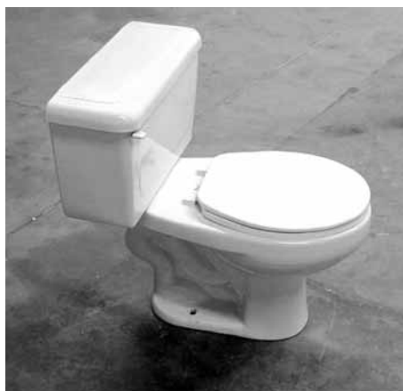
Figure 1 Two-piece toilet

In your home the toilet uses the most water—accounting for approximately 30 per cent of indoor water use.